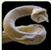
Electron micrograph of an adult lungworm

This is a problem for dog owners since dogs may unwittingly swallow infected snails and slugs (or their slime trails) whilst exploring parks and gardens. Once swallowed, the larvae migrate to the heart where they will develop into adult worms.