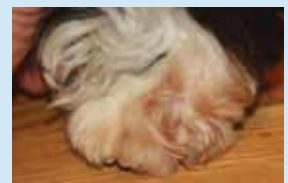
Paw chewing in a dog: Discoloured hair is a sign of excessive grooming.

Inhaled allergies are common at this time of year – during the spring and summer months a surge in pollen levels can lead to seasonal allergies in humans and pets alike. However the symptoms are often very different; whilst humans get 'hay fever' and sneeze, affected pets tend to show skin symptoms – becoming itchy . Dogs may show generalised itchiness, but more commonly may show localised signs of paw chewing, face rubbing and itchy ears (leading to recurrent ear infections).